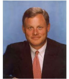
US Sen. Richard Burr