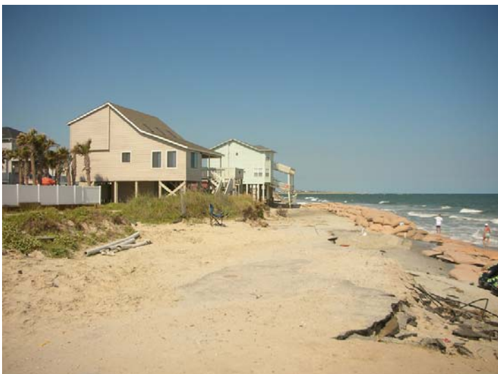
Surveying the sandbags protecting a public street on the east end of Ocean Isle Beach