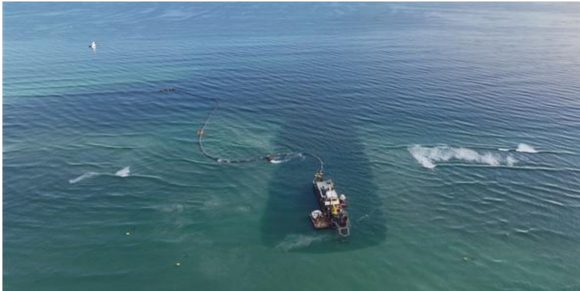
Topsail Inlet 2023-2024